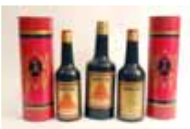
Passe Passe Bottles Good Condition