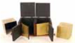
Break-Away Die Box Good Condition