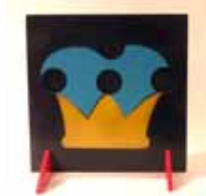
Ball Vanisher Good Condition