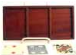
William Tell Card Frame Good Condition