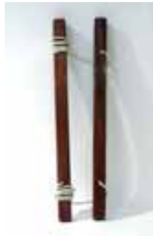
Devil's Pillars Good Condition