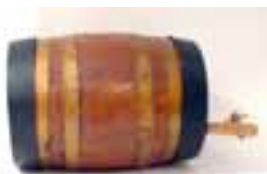
Keg Or Barrel Of Plenty Good Condition