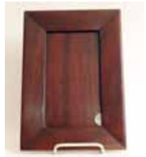
Coin Tray Good Condition