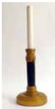
Vanishing Candle Good Condition