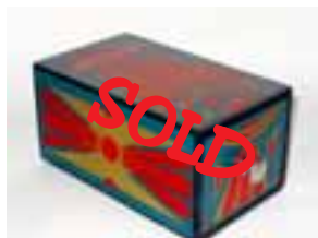
Drawer Box Good Condition