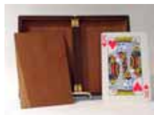
Jumbo Card Locking Card Box Good Condition