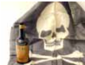
Yo Ho Ho & A Bottle Of Rum Good Condition