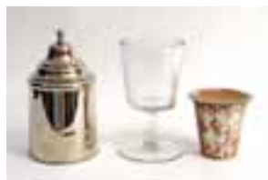
Bran Vase Good Condition