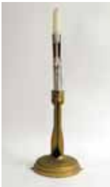
Acrobatic Candle Good Condition