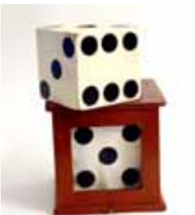
Phantom Die Good Condition