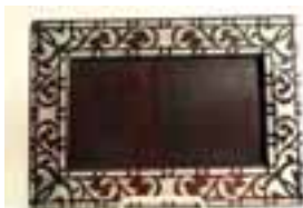
Master Coin Tray Very Good Condition