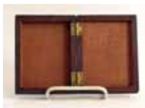
Small Locking Card Box Good Condition