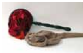
Wooden Change Bag Plus Holder (Small Rim Damage) Good Condition