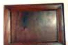
Phantazma Coin & Card Tray Good Condition