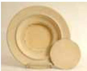
Handkerchief Plate Good Condition