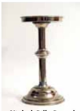
Nickel Silk Stand (Large) Good Condition