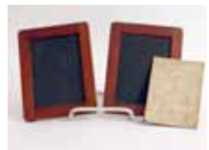
Smaller Slate With Newspaper Back Good Condition