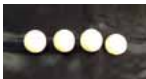
Billiard Balls & Shell (White) Good Condition