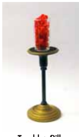
Tumbler Silk Pedestal Good Condition