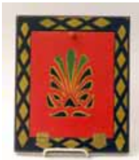
Miracle Frame (Large) Good Condition