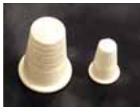
Simplex Enlarging Thimbles Good Condition