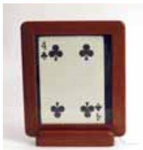
Large Card Frame Good Condition