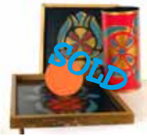
Lemon & Orange Tray Mystery