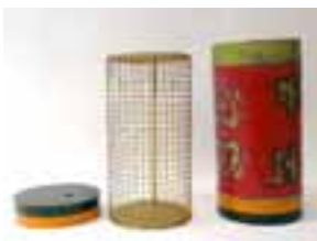
Magical Incubator Good Condition