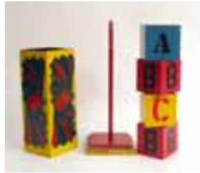
ABC Blocks Good Condition