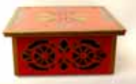
Haunted Chinese Bird Chest Good Condition