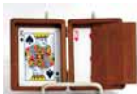
Small Non-Locking Card Box Good Condition