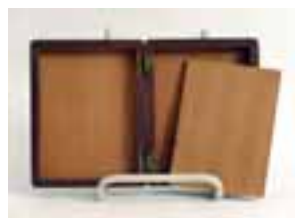
Small Non-Locking Card Box Good Condition