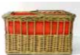
Super X Changing Basket (Old Wicker) Good Condition