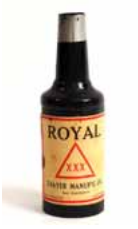
Silk Vanishing Bottle Good Condition