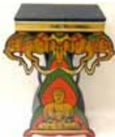
Homer Hudson Elephant Table Good Condition