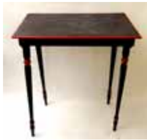
Ethereal Floating Table Good Condition