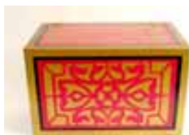
Mirror Box Good Condition