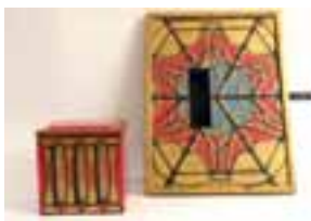
Chest Of Chu Chin Chow Good Condition