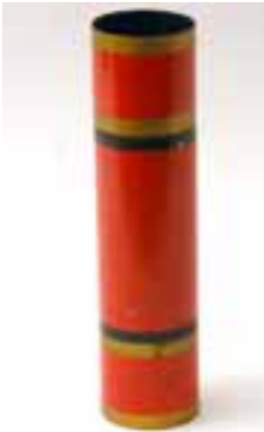
Waller Enchanted Tube (Large) Good Condition