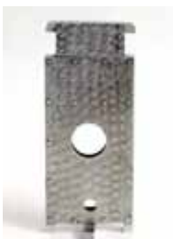
Finger Guillotine Very Good Condition