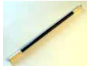
Bang Wand Good Condition