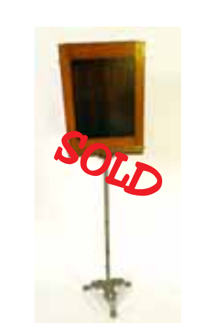
Drop Down Production