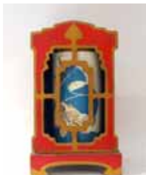
Medium Square Circle With Full Base Fair Condition