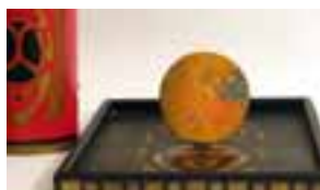
Lemon & Orange Mystery (Orange Needs Paint) Fair Condition