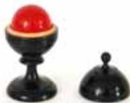
Ball Vase Like New Condition