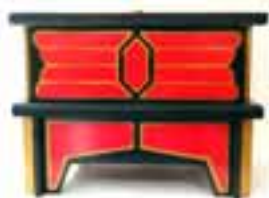
Rapid Rabbit Vanish Good Condition