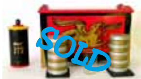
Griffin Checker Cabinet