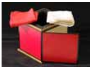
Chameleon Box & Silks Very Good Condition