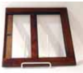
Solid Through Solid (Brown) Good Condition