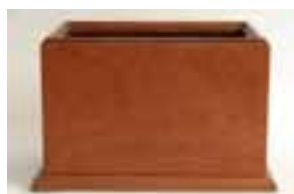
Double-Sided Non- Locking Jap Box Good Condition