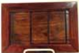
LSMFT Tray (Lucky Strike Means Fine Tobacco) Good Condition