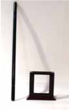
Tom Seller's Card Rise Good Condition