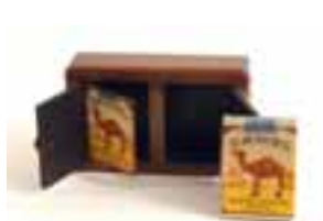
Sucker Cigarette Die Box With Camel Good Condition