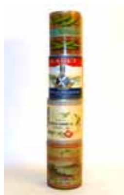
Nesting Set Of Cans Good Condition