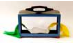
Lloyd's 20th Century Silk Frame Good Condition