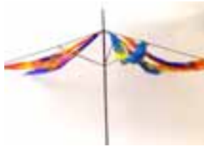
Milady's Parasol With Changing Hand Bag Fair Condition