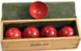
Billiard Balls & Shell (Red) Good Condition