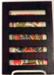
Slat Card Frame With Jack Of Hearts (No Extra Card) Good Condition