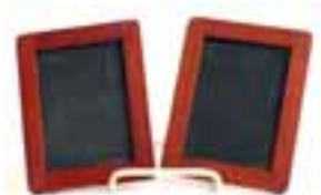
Original Slate Mystery Good Condition