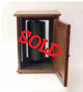
Production Cabinet Good Condition