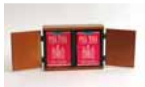
Sucker Cigarette Die Box With Pall Mall Good Condition