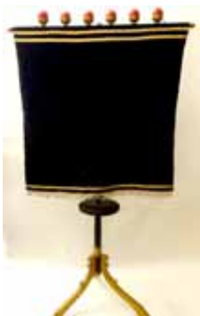
Combined Contrast Screen Good Condition