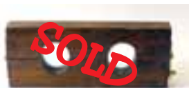
Stocks Of Solomon