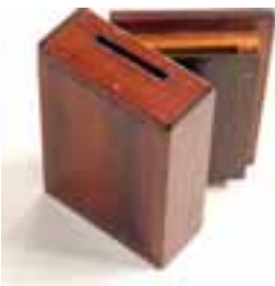
Coin Box (Square) Good Condition