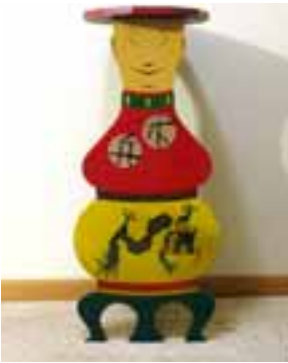
Chinko Side Table Very Good Condition