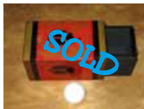
Drawer Box Scarab Design Small Version Good Condition