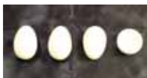
Taking Eggs To Market (Egg Shell needs paint) Fair Condition