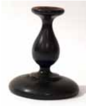
Wood Turned Pedestal (Hallmarked) Good Condition