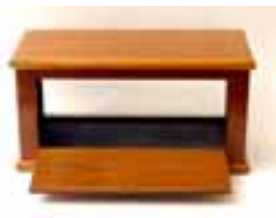
Cut & Restored Necktie Cabinet Good Condition