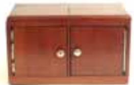
Die Box Good Condition