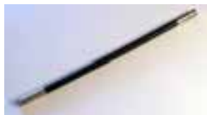
Wanda Wand Good Condition