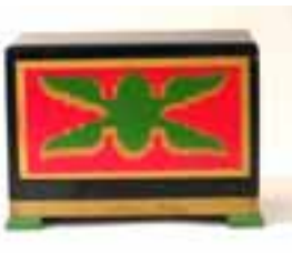
Silk Cabby With 4-Legged Creature Good Condition