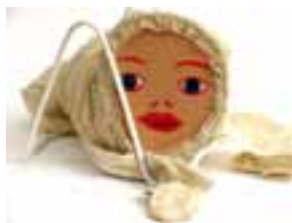
Spring Baby Production Good Condition