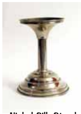
Nickel Silk Stand (Small) Good Condition