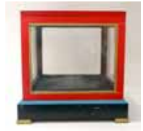
Crystal Dove Cote Good Condition