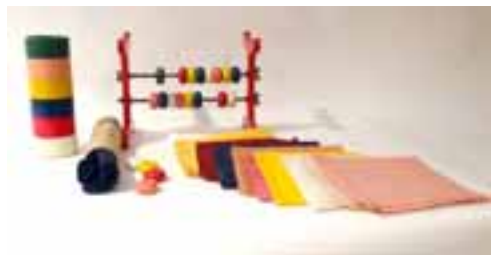
Nic's Napkins Good Condition