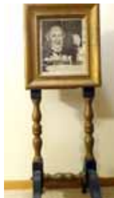
Stage Size Spirit Painting (Frame Only) Fair Condition