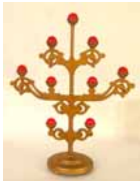
Peerless Billiard Ball Stand With Carrying Case Good Condition