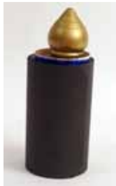
Barbershop Pole Production Good Condition