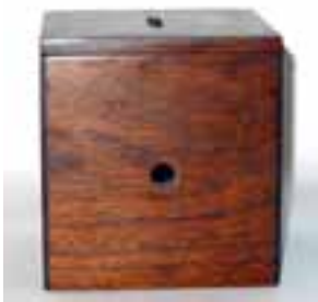
Baffo Box Very Good Condition