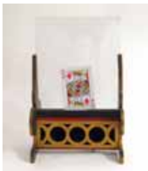
Card Through Glass Good Condition