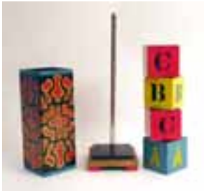
ABC Blocks Good Condition