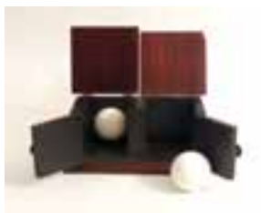
Sucker Billiard Ball Box Fair Condition