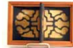
Card Switch Tray Good Condition