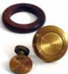
Improved Penny & Brass Weight Very Good Condition