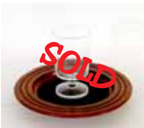
Card Rising Plate