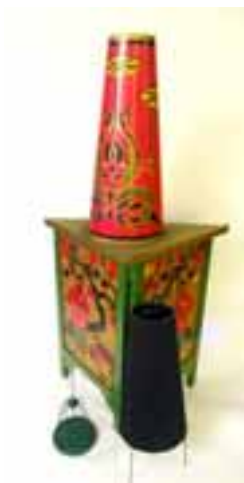
Supreme Flower Production Good Condition