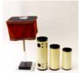
Lloyd's Mirage Vanishing Glass Of Water Good Condition