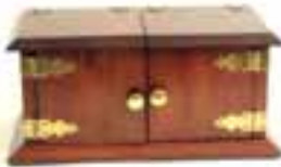
Die Box Good Condition