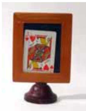
Presto Card Frame Good Condition