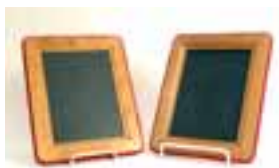
Dr. Q Slates Good Condition