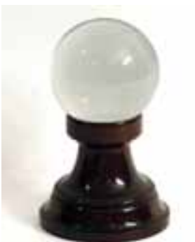
Hand Turned Pedestal With Gazing Ball Very Good Condition