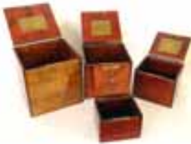
No Assistant Nest Of Boxes Very Good Condition