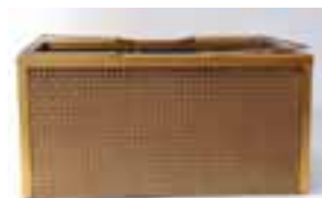
Super X Changing Basket Good Condition