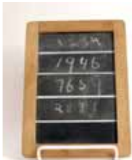
New Miracle Slate Good Condition