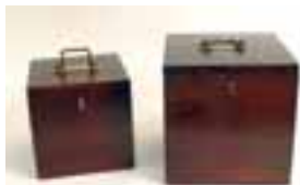
Coin In Ball Of Wool Very Good Condition