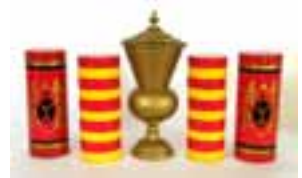
Rice - Checkers - Orange Fair Condition Tops Of Tubes Do Show Wear.