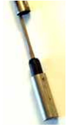
Silk Wand With Wood Insert Good Condition