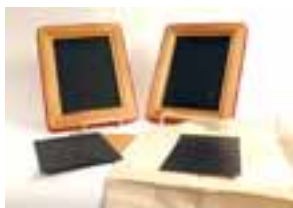
Dr. Q Slates With Extra Slates (Real Slate) Very Good Condition