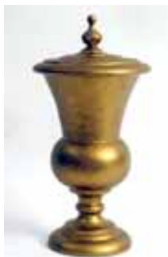
Gold Gesso Rice Vase Fair Condition