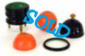
Tarbell Orange Vase Good Condition