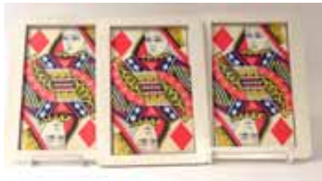
Find The Lady Good Condition