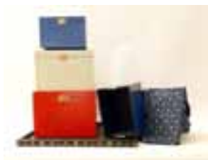
Three Boxes, A Dove & Mysterious Flight Good Condition