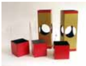
Block Go Penetration Good Condition