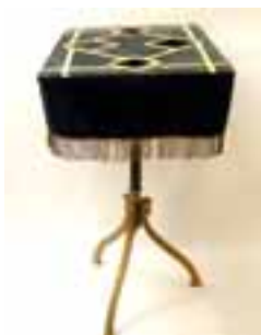
Colonial Table Good Condition