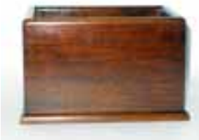
Single-Sided Non- Locking Jap Box Good Condition