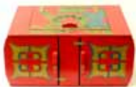
Jack Gwynne's Rabbit Box Good Condition