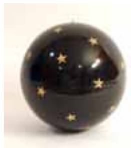
Floating Ball Good Condition