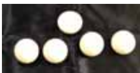
4 Billiard Balls & Shell (White) Good Condition