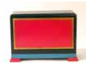
Silk Cabby Red Center (Black, Blue, Gold & Red) Good Condition