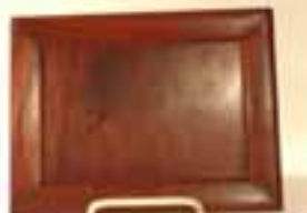
Card Tray Good Condition