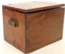
Inexhaustible Box Good Condition