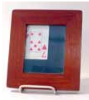
Card Sand Frame Good Condition