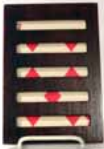
Slat Card Frame With 7 Of Hearts Good Condition