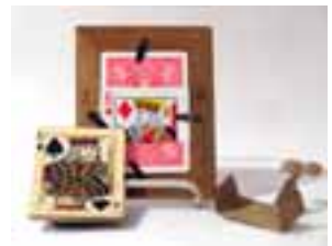
Diminishing Cards, Simplexo & Small Frame Good Condition