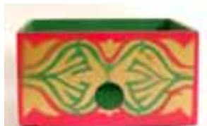
Torn & Restored Turban Good Condition