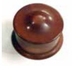
Coin Box (Round) Good Condition