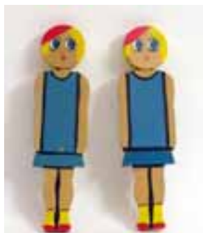
Little Red Riding Hood Bonus Genius (No Cloak) Good Condition