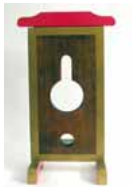
Wrist Guillotine Good Condition