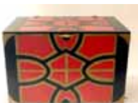
Production Box With Cloth Holder Good Condition