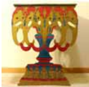
Elephant Head Center Table Good Condition