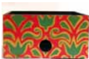
Torn & Restored Turban Good Condition