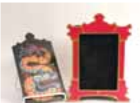
Wu Ling Pagoda Good Condition