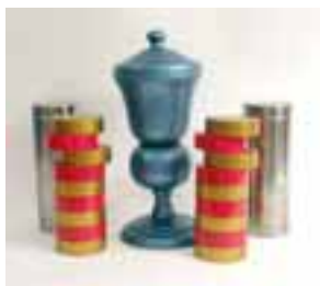
Blue Rice Vase With Checkers Good Condition