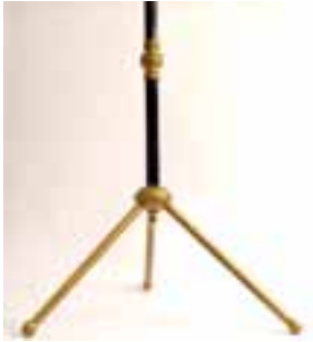
Table Base Good Condition