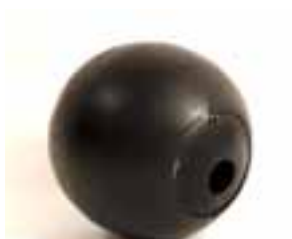
Cannonball From Hat Good Condition