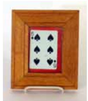
Sand Frame Good Condition