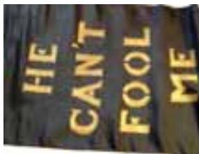
Wand Of Laughter Good Condition