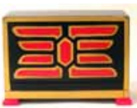
Silk Cabby With Four Horizontal Bars Good Condition