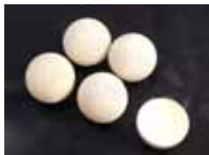
Clingo Billiard Balls & Shell Very Good Condition