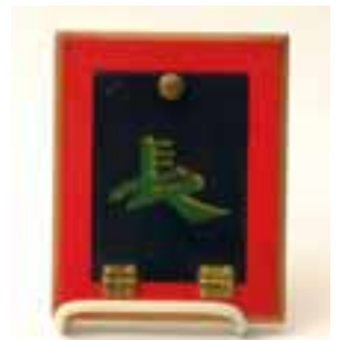
Miracle Frame (Small) Good Condition