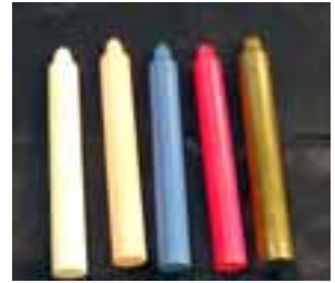
Aladdin's Candles (Missing Compass) Good Condition