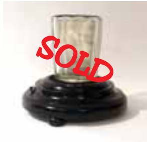
Turntable & Holmes Mirror Glass Good Condition