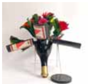
Flowers From Bottle Fair Condition