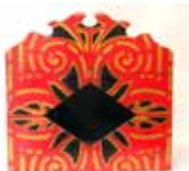
Trip To Spooksville Cabinet Only Good Condition