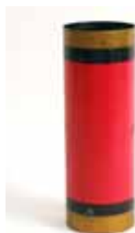
Ghost Tube Good Condition