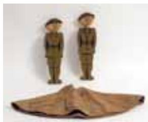
Private Pat Bonus Genius With Pup Tent Good Condition