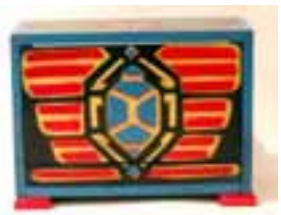
Silk Cabby With Scarab Good Condition