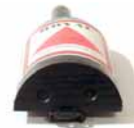
Spring-Hinged Half Bottle Production Good Condition