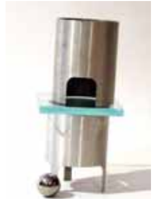
U-235 Original Very Good Condition