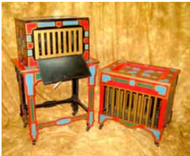
Hong Kong Duck Vanish Good Condition