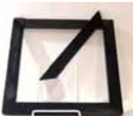
Solid Through Solid (Ebony) Very Good Condition