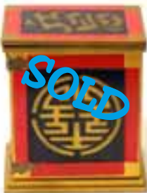
One Hand Production