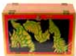
Jack Gwynne's Flip Over Dove Vanish Good Condition