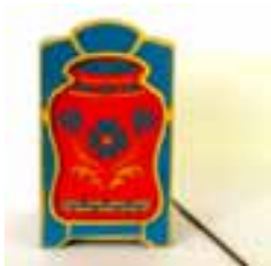
Baffling Bottle Of Koke Good Condition