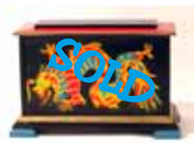
Silk Cabby With Dragon Good Condition