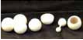
Multiplying Balls Good Condition