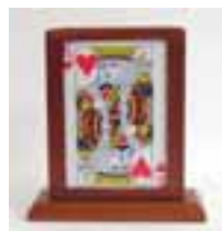
Large Ungimmicked Card Houlette Good Condition