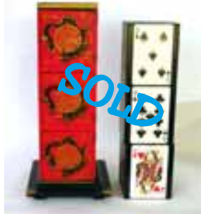
Jumbo Find The Lady Cubes