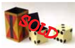
Die & Chimney Good Condition