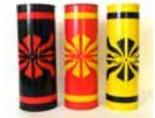
Oriental Tubes Of Mystery Good Condition