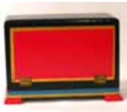
Silk Cabby With Red Center Good Condition