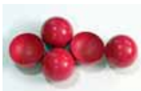
3 Billiard Balls & 2 Shells (Red) Good Condition