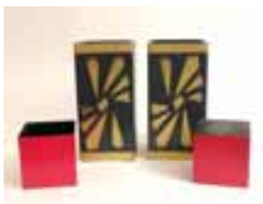
Block Go Penetration Good Condition