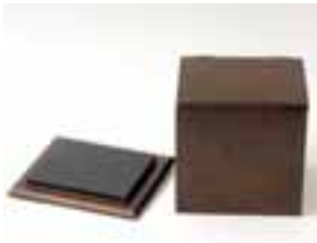
Card Rising Box Unique Very Good Condition