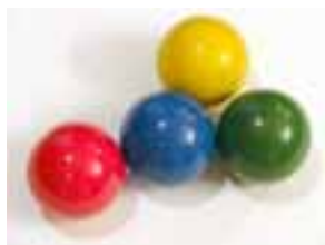
Rainbow Billiard Balls Very Good Condition