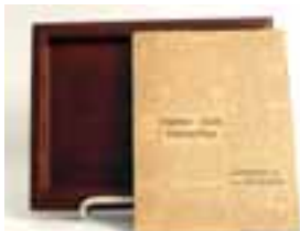
Card Tray With Newspaper Backed Insert Good Condition