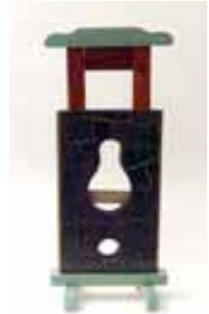
Wrist Chopper Good Condition