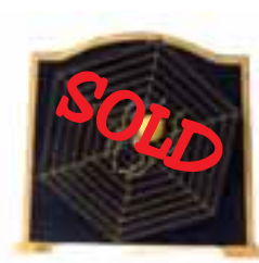
Card Spider Good Condition