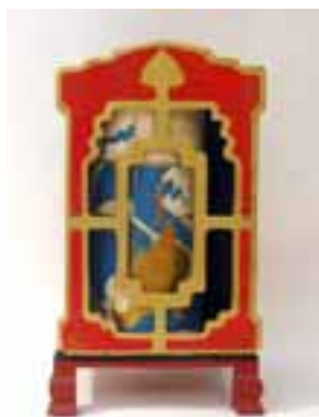
Medium Square Circle With Leg Base Fair Condition