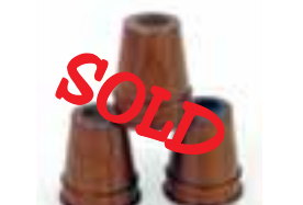
Wooden Cups & Balls