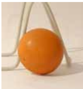
Orange Shell Very Good Condition