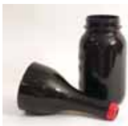
Dove Production Bottle Good Condition