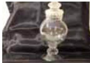
Crystal Coin Vase Very Good Condition