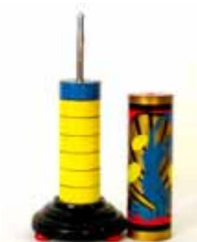
Small Blue Phantom Fair Condition