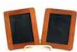
Original Slate Mystery Good Condition