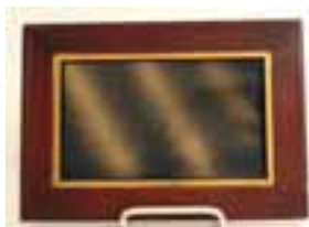
Card Switch Tray Good Condition