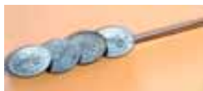
Coin Wand Good Condition