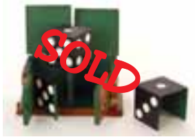
Midget Sliding Die Box Good Condition