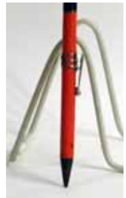
Card In Egg Pencil Good Condition