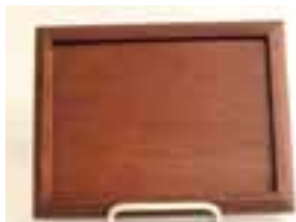
Thayer's Changing Card Tray Good Condition