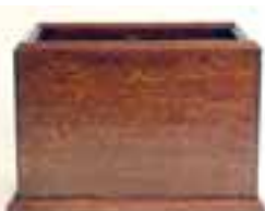
Double-Sided Locking Jap Box Good Condition