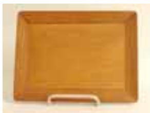
Card Tray Fair Condition