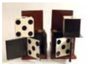
Break-Away Die Box Good Condition