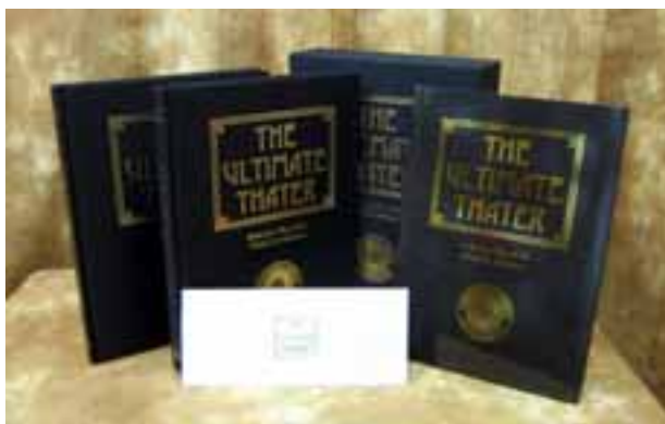
Doc Albo's The Ultimate Thayer Collection Books & DVDs Brand New Condition