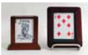
Card Houlette (Small) & Card Frame Good Condition