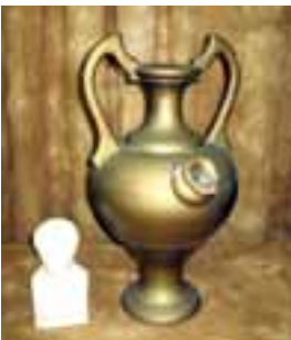
Talking Vase Good Condition