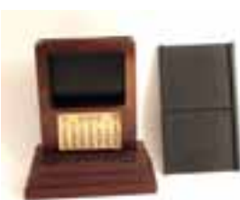
Devil's Mailbox Good Condition