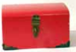
Dr. Q Prediction Chest Good Condition